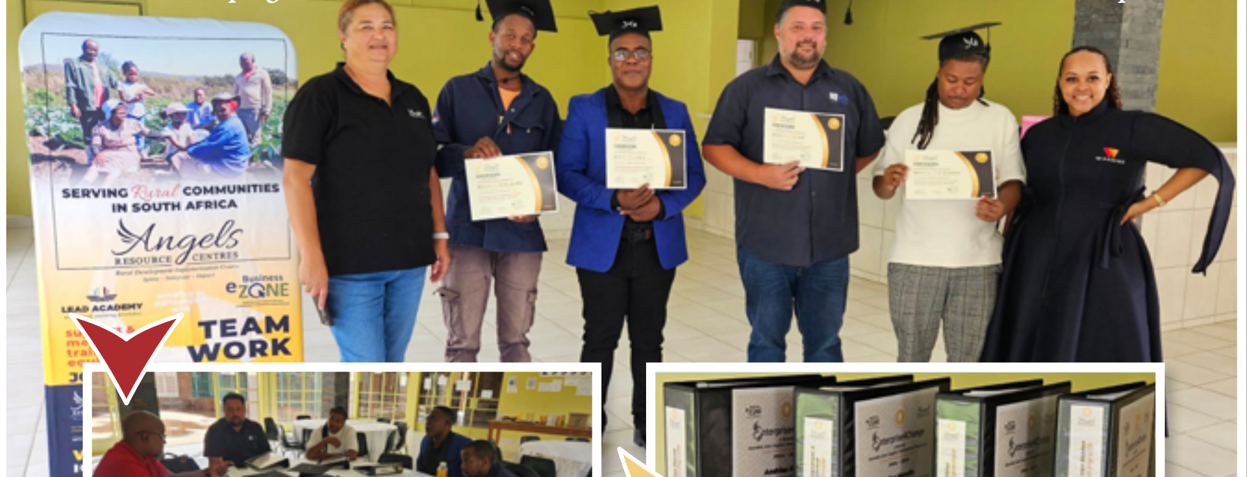
End of Programme Celebration April 2025