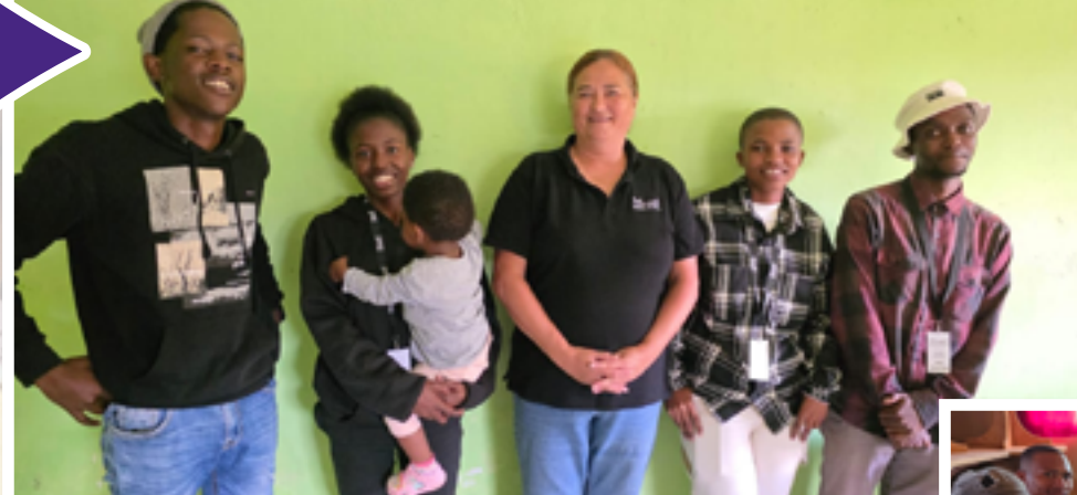
Community Needs Assessments (CNA) being conducted by Angels in Beaufort West, Sterkstroom & Molteno

Community engagement is a critical element in the work we do, and it's always heartwarming to see residents from the communities we operate in show up with keen interest and enthusiasm to hear about the opportunities we are working to bring to their towns! Guided by our Life Chain Approach to development, the CNAs are focussed on understanding the people, the priorities and the potential in these communities. By employing local youth as data collectors, we create immediate job opportunities that provides valuable work experience, while ensuring that future programmes are shaped by the authentic voices of the people they serve.