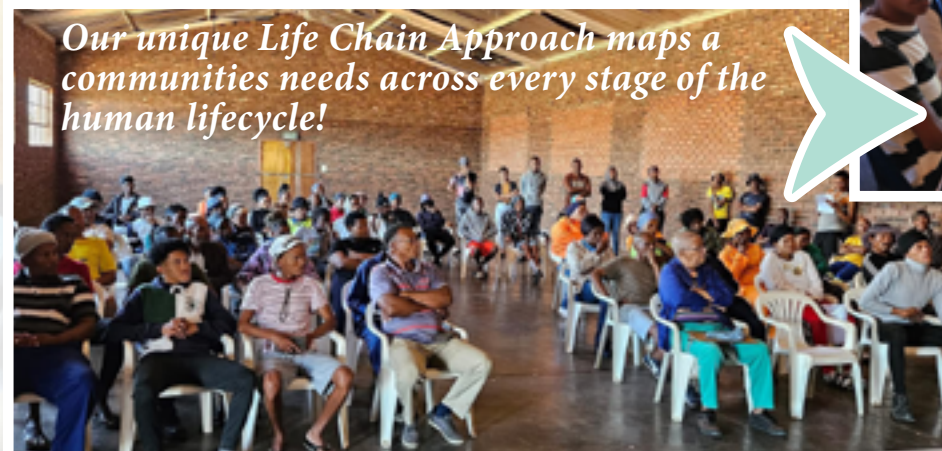
Our unique Life Chain Approach maps a communities needs across every stage of the human lifecycle!