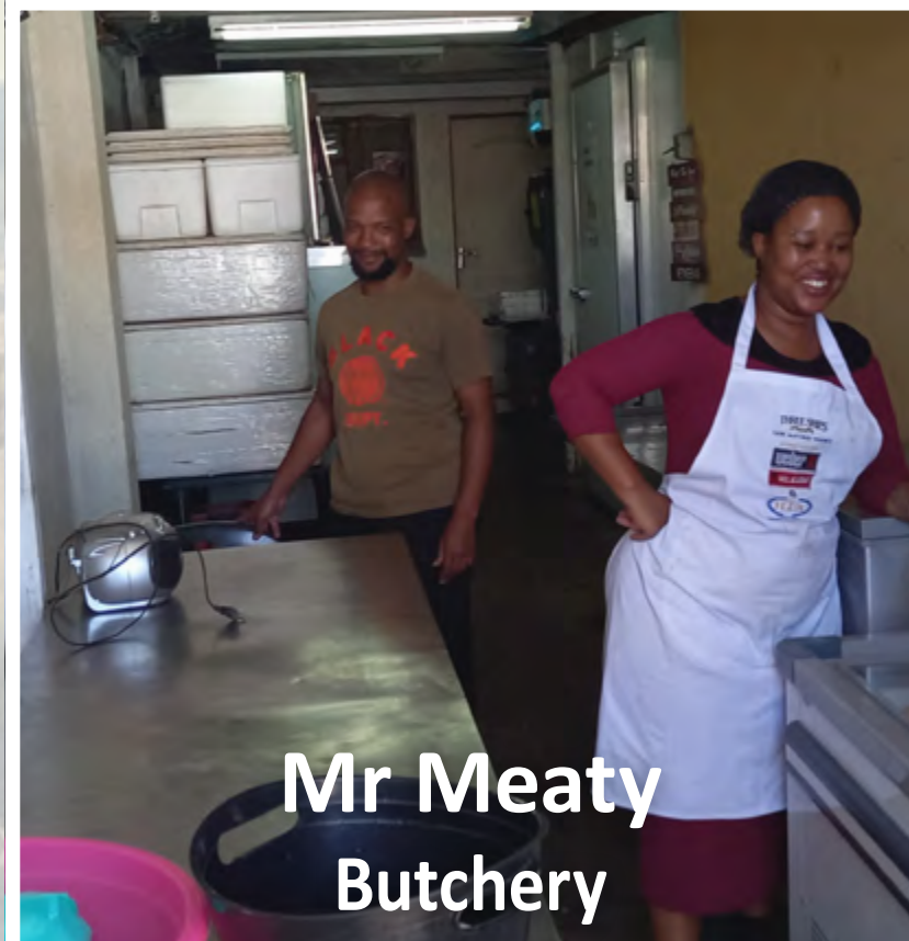
Mr Meaty Butchery