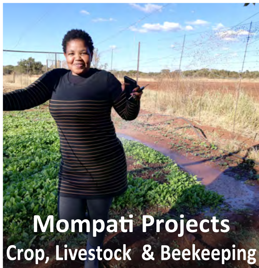
Mompoti Projects Crop, Livestock & Beekeeping