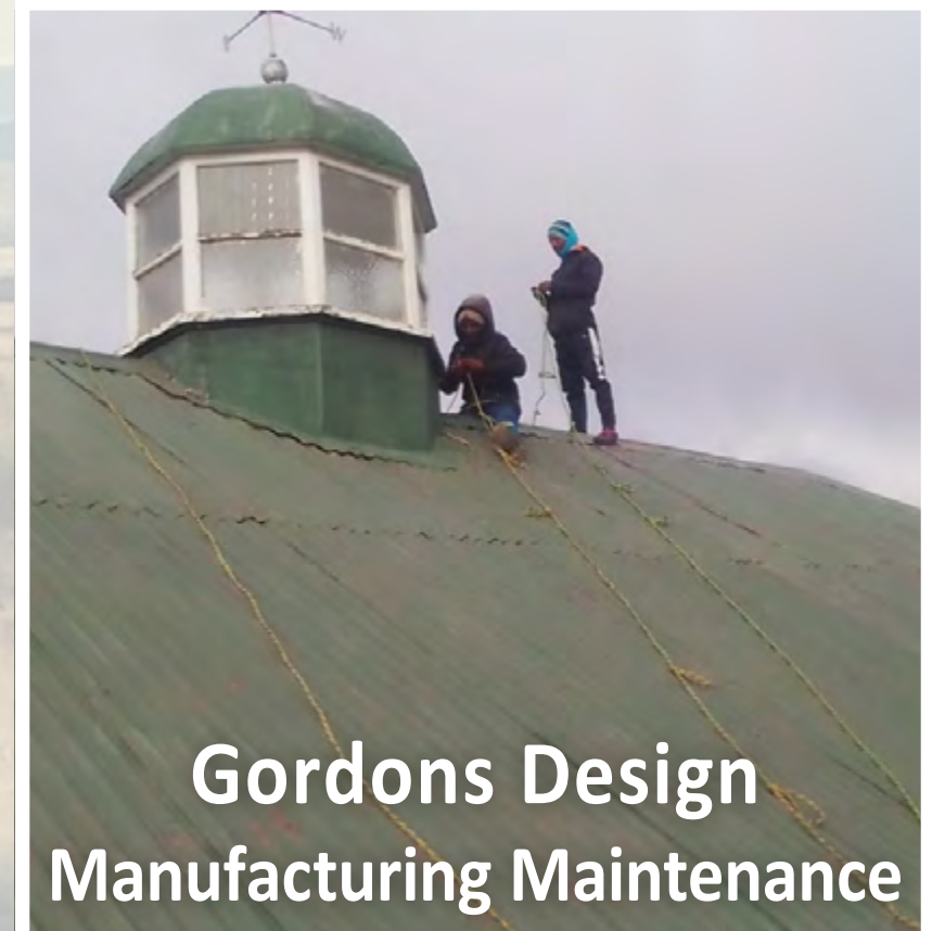
Gordons Design Manufacturing Maintenance